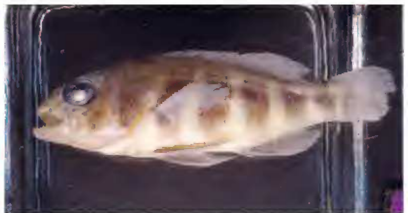
FIGURE 15. Serranus heterurus in alcohol; specimen from the Cape Verde Islands (ZSM 430516).